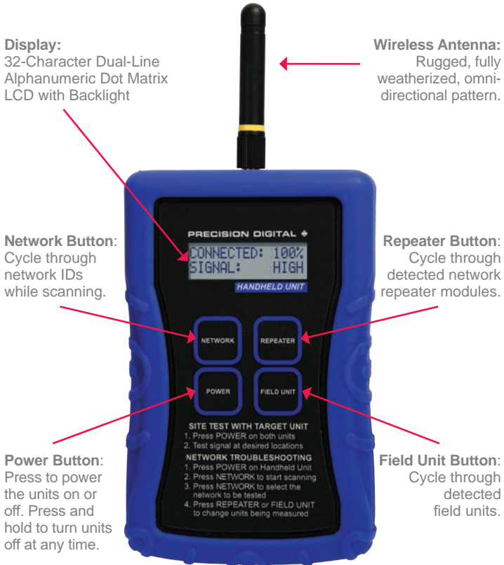
▲ PDA10 Handheld Unit Shown

The four buttons on the face of the handheld unit make it simple to power on the unit and start testing your devices for wireless signals. Cycle through any of your network to test field units and repeaters for strong wireless signals.