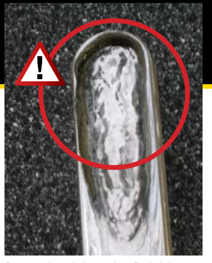
Dangerously eroded gage glass. Eroded glass is often not visible without inspection of disassembled gage.